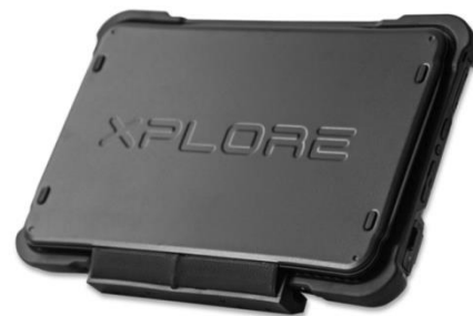
Keyboard in closed position via magnets, protecting display glass