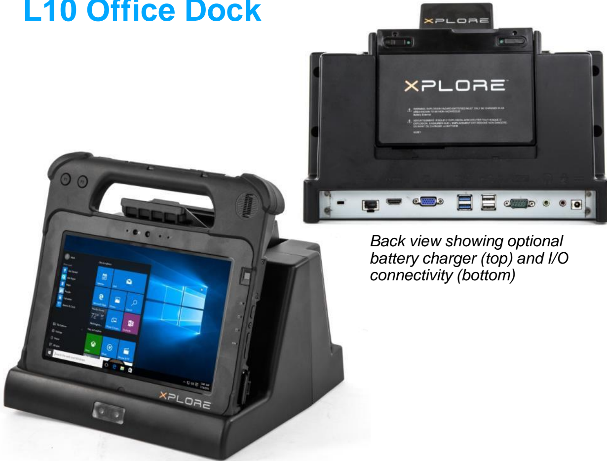
Back view showing optional battery charger (top) and I/O connectivity (bottom)